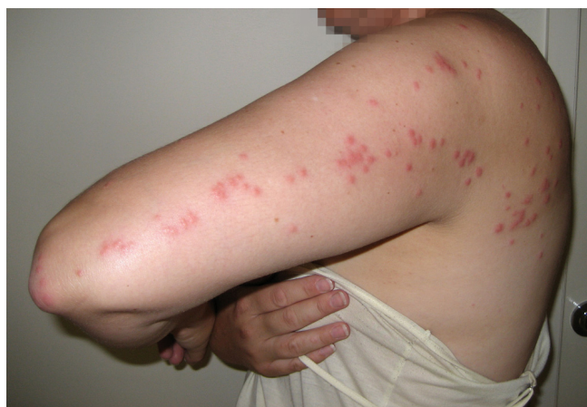
FIG 6 Lines of bites along the arm. The bed bug species was not identified.

Vesicles and bullae containing clear or bloody exudate that appear some days following a bite have been reported (75, 115, 172,