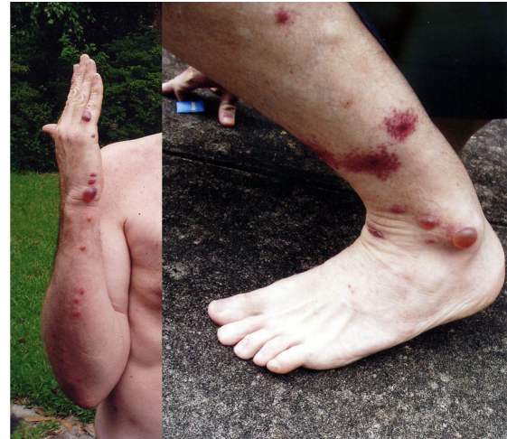
FIG 9 Bullae with hemorrhagic serum on the hands and ankles from the bite of C. lectularius (identified by the authors). These appeared between 24 and 36 h following the bites. The purpuric/necrotic lesions on the ankle indicate the severity of the reaction. (Reprinted from reference 105.)

The largest of the early studies was undertaken at an internally displaced-person camp in Freetown, Sierra Leone (119). Of 221 individuals living with bed bugs, 196 (86%) had wheals from the bites, although it was not stated what percentage of the individuals had previous exposure to bed bugs. The study was further complicated in that both C. hemipterus and C. lectularius coexisted in the camp, and no attempt was made to distinguish the relative clinical reactions from the two species. To date, no study has com-