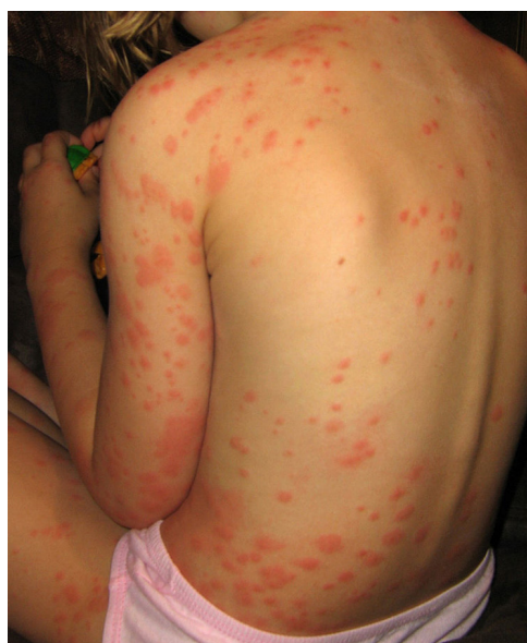
FIG 7 A 4-year-old girl bitten by hundreds of C. lectularius bed bugs (identified by the authors). Multiple discrete bed bug wheals, some with purpuric centers, cover much of the body. (Reprinted from reference 105.)