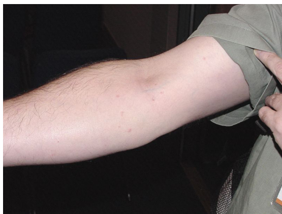
FIG 4 Bite reactions the morning after being bitten by bed bugs. The bites are faint erythematous macules and papules 2 to 3 mm in diameter. The bed bug species was not identified; the bites occurred in a region where both C. lectularius and C. hemipterus occur. (Reprinted from reference 105.)

at the time of the bite (70, 79, 266), but this has not been observed in our experience. If there are large numbers of bed bugs (Fig. 7), the individual lesions can coalesce to give the appearance of a more generalized rash, possibly enhanced by trauma, such as scratching, to the affected areas (Fig. 8), complicating the differential diagnosis (49, 70, 194, 267, 287). If the bed bug infestation is unrecognized or not treated, the cutaneous reactions can become chronic (46, 73), and dermatitis “outbreaks” from bed bug bites have been reported in health care facilities (81). Bite reactions can take some weeks to resolve (130), depending on the severity of the reaction. Patients with multiple bites or a severe cutaneous reaction may develop systemic symptoms, including fever and malaise (182), although this appears to be rare (42).