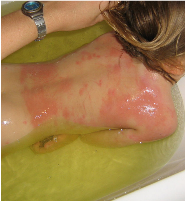
FIG 8 Same patient shown in Fig. 7. A diffused erythema has developed in the more severely bitten areas. This could be the result of trauma (e.g., scratching) to the affected areas.

per and lower dermis around vessels and epidermal adnexal structures, a perivascular inflammatory infiltrate in the papillary dermis, and lymphomononuclear cells and numerous eosinophils around the vessels and between the collagen fiber bundles have all been observed (78). Intra- and subepidermal bullae with an inflammatory infiltrate composed mainly of lymphocytes, histiocytes, and some neutrophils and eosinophils have also been noted (288). However, the correlation of specific histopathological findings with the timing of the initial bites is limited, and further investigation is needed.