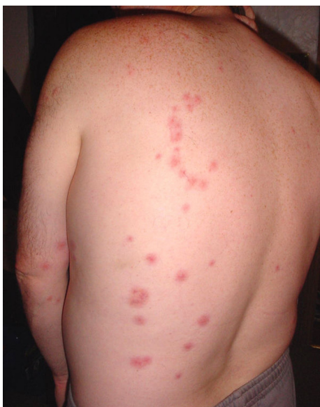
FIG 5 Same patient shown in Fig. 4 but 4 days later. Lines of bites that run along the body can be observed, along with the classic bed bug wheal, measuring 2 to 3 cm in diameter. (Reprinted from reference 105.)

The immune basis of the clinical reaction is largely uncertain. In one study of 15 patients with papular urticaria, all had IgG antibodies to C. lectularius antigens, although as whole ground dried salivary glands were used as the antigen, the antibody responses to the individual antigenic proteins were not identified (1). Nitrophenol has been shown to induce allergen-specific IgE antibodies in one patient hypersensitive to the bite (181). Similarly, the pathological changes in the skin from a bed bug bite have been poorly studied. Biopsy specimens of the bites show edema present between the collagen bundles in the dermis, with lymphocytes and numerous eosinophils being present around the blood vessels (73). Epidermal spongiosis and inflammatory infiltrate in the up-